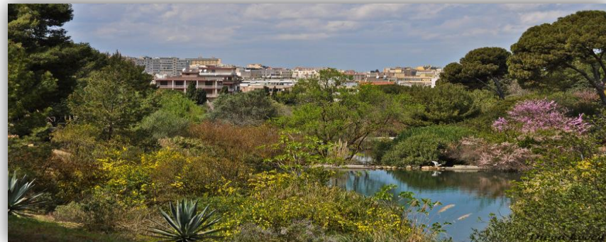
COLLE SAN MICHELE