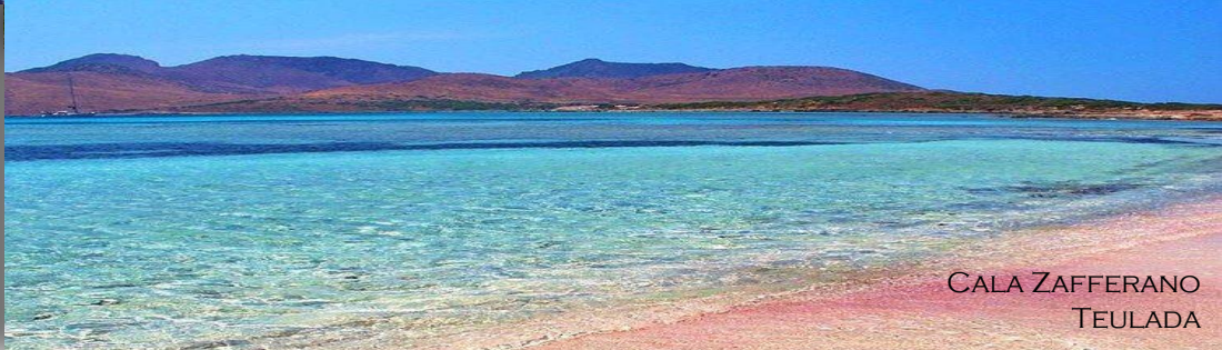
CALA ZAFFERANO TEULADA