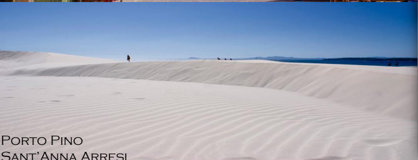
PORTO PINO SANT'ANNA ARRESI